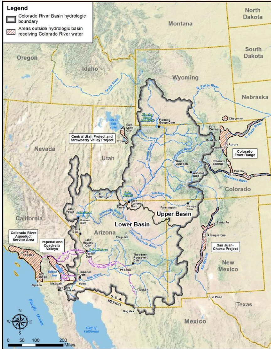
Figure 1. Colorado River Basin 38