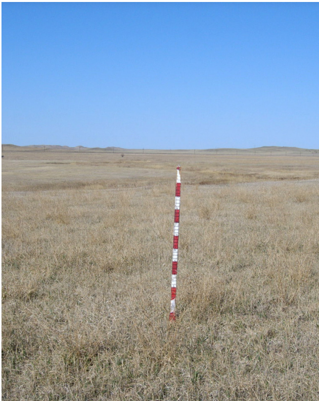
Figure 6. Although this photo lacks a photo identification board, the reference pole (marked in decimeters) clearly indicates the height of vegetation.

Put the reference pole a consistent distance from the camera and record it in your field notebook.