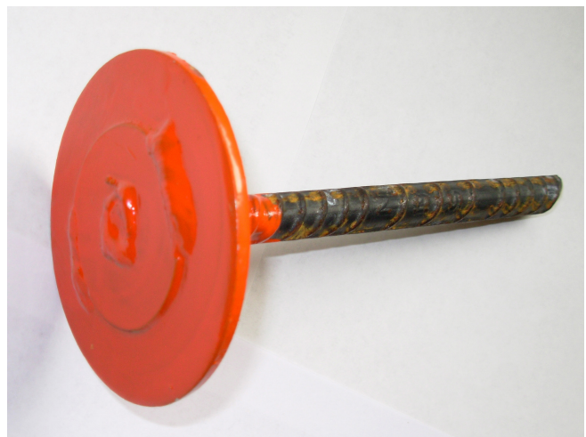
Figure 2. Example of a welded stake. Discs on top are metal washers and are welded to a piece of rebar cut at an angle. Discs were painted with orange implement paint, which doesn't degrade as quickly as other types of paints.