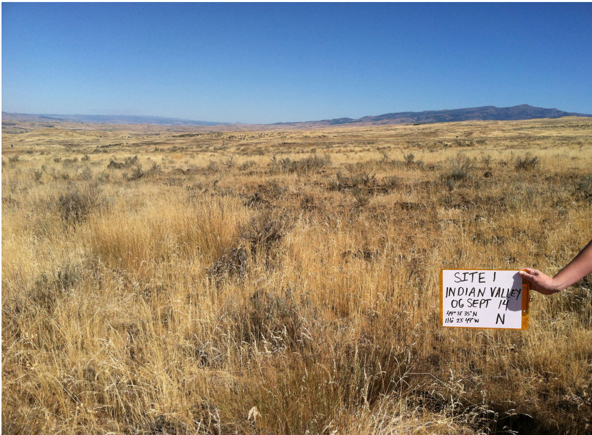
Figure 1. Example of a photo identification board with complete information including plot name (site 1), allotment/pasture name (Indian Valley), bearing (N), date, and GPS coordinates.