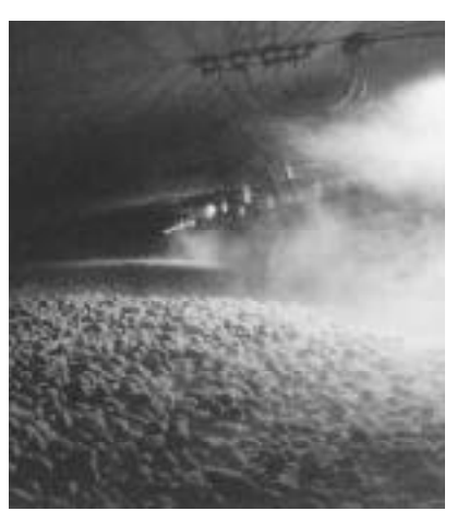
Figure 2. During treatment the CIPC aerosol is circulated throughout the potato pile by the circulation fans. The aerosol quickly fills the air spaces around the potatoes and inside the building as it is being deposited on the potato surfaces.

The second method uses a hot plate heated by propane or electricity instead of heated air to vaporize the CIPC. This procedure was first used in the developmental phase of CIPC storage treatment by Pittsburgh Plate & Glass Co. and is still used by some applicators.