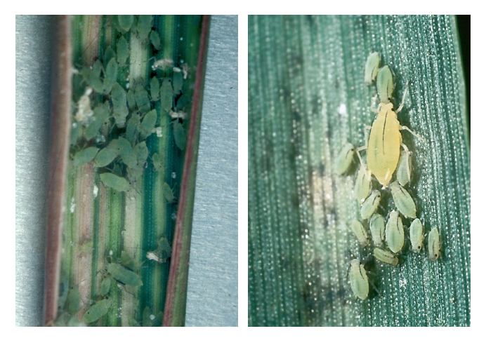
Figure 2. Typical Russian wheat aphid ( Diuraphis noxia ) (left) and greenbug ( Schizaphis graminum ) (right) colonies. Note the clustering behavior and different sizes of wingless individuals.

There are several species of aphids that colonize cereal crops in Idaho. Multiple species often co-occur in the same field, making differentiating between these species in the field difficult. One exception is the Russian wheat aphid, which is more easily identified by its lack of conspicuous cornicles ("tailpipes" toward the back of the body) (Figure 3), in contrast to the much longer, easily noticeable cornicles found in other cerealcolonizing species. A hand lens or microscope may be necessary for accurate species-level identification. Correct identification of aphid species can be important for making optimal management choices. More information and identification resources for cereal colonizing aphids can be found in Adhikari et al. 2022 or Hein et al. 2005. Because species-level identification can be extremely challenging, consult local university Extension personnel as often as possible.