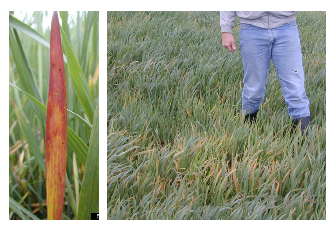
Figure 7. Symptoms of Barley yellow dwarf virus . Reddish and yellowish leaf discoloration on wheat (left); field showing several oat plants suffering from characteristic BYDV yellowing (right).

can vary, the most common are stunting of leaves, roots, and seed heads and a yellow and/or reddish discoloration of the leaf tips that slowly spreads down the leaves as the infection progresses (Figure 7). While BYDV can impact either winter or spring cereal crops, it is a larger concern for winter crops planted in the fall. On average, BYDV causes yield reductions between 10% and 20% in infected fields, though losses as high as 70%–100% have been reported when infection occurs early after plant emergence. For more information, see <u>Marshall and Rashed 2014</u>.