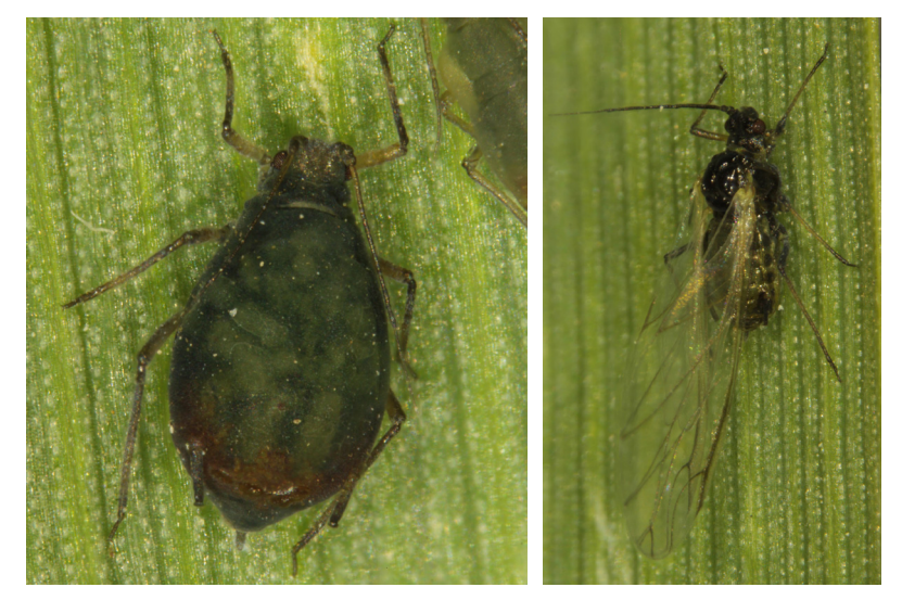
Figure 1. Adult bird cherry-oat aphids: wingless (left) and winged (right).

In general, aphids are small, 1/32–1/8 inches (0.8 – 3.2 millimeters) and are plant-feeding insects with soft bodies. They are usually oval-to pear-shaped and may be green, black, yellow, or reddish in color. While immature aphids are always wingless, wings may be present or absent in adults (Figure 1). One of the best ways to distinguish aphids from other arthropods is the presence of cornicles (also called siphunculi ), which are paired, rear-facing "tailpipe"-like structures situated toward the back of their body. However, note that in some species, including the Russian wheat aphid, the cornicles are very small.