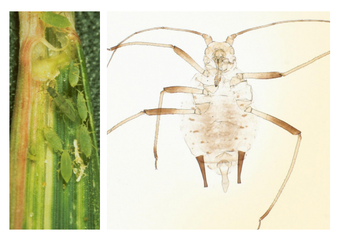
Figure 3. Russian wheat aphid ( Diuraphis noxia ), showing highly reduced cornicles (left), and slide mount of an English grain aphid ( Sitobion avenae ) (right), showing prominent cornicles.

Aphids feed by piercing plants with needle-like mouthparts and sucking out nutrient-rich sap. Most cereal-colonizing aphids feed on a diverse array of grasses and grasslike plants, such as sedges, rushes, and cattails. Depending on the species, aphids may use a single host plant species year-round or use different hosts during different seasons. Aphid species that use different hosts depending on the season (a strategy called host alternation ) usually use a woody host plant during the winter and a cereal or grass during the summer. Examples of host-alternating aphids include