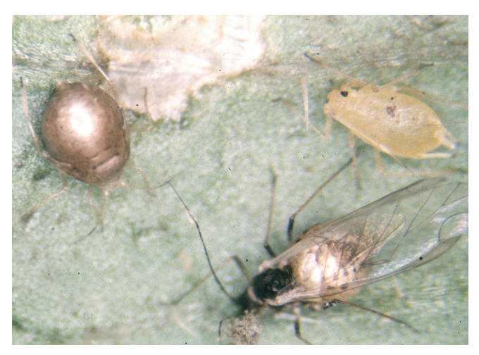
Figure 8. Aphid "mummies," winged and wingless form, that have been attacked by parasitoid.

While scouting for aphids, also look for beneficial insects such as ladybugs, lacewings, syrphid fly larvae, and aphid "mummies" (Figure 8), which are a sign of parasitoids at work. Also keep an eye out for aphids that have been killed by disease or fungi. These aphids may appear bloated, off-color, flattened to the leaf surface, or fuzzy. The presence of predators, parasitoids, disease, or beneficial fungi may be sufficient to reduce aphid numbers significantly within a few days, mitigating the need for other control measures.