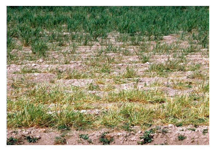
Figure 6. Damage on wheat caused by Russian wheat aphid ( Diuraphis noxia ), showing rows of yellowed plants showing symptoms similar to drought damage.

broken down into two types: physical effects caused by the feeding activity of the aphids and transmission of plant-pathogenic viruses.