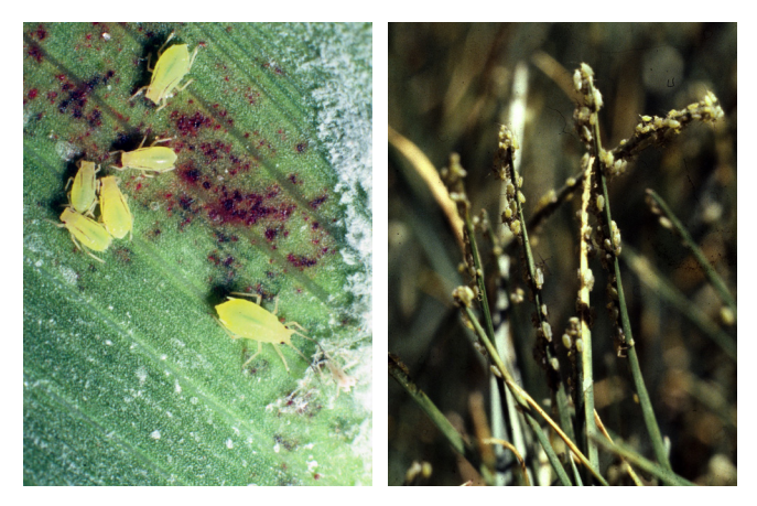
Figure 4. Damage on grasses caused by greenbug ( Schizaphis graminum). Notice the characteristic reddish patches of discolorations on sorghum (left) and yellowing/dead leaves on bluegrass (right).