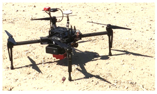
Figure 2. Matrice 100 UAV equipped with the RedEdge-M Camera.

Table 1 . Effect of N and irrigation rates on sugar beet rootyield and estimated recoverable sugar (ERS), Parma, Idaho,2019 and 2020.