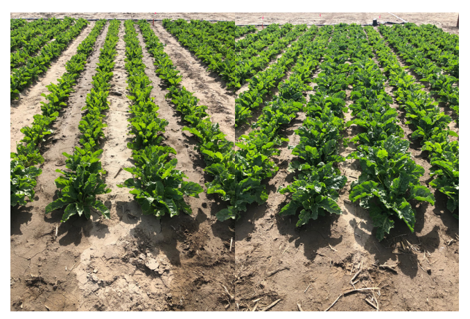
Figure 1. Sugar beets treated with 50% water + 100 lb N/a (left) and 100% water + 300 lb N/a (right), Parma, Idaho, June 10, 2019. ET = evapotranspiration.

The effects of N and irrigation rates on sugar beet root yield and ERS were assessed. The relationship between UAV-NDVI and sugar beet root yield and ERS were evaluated. Data were analyzed using SAS statistical software 9.4 (Littell et al. 1996). The effect of N rate on sugar beet root yield and ERS is reported in Table 1.