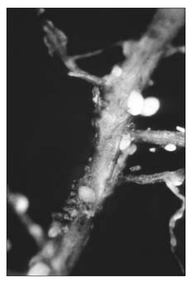
Figure 4. Lemon-shaped white E's and brown cysts.

Crop rotation is the simplest and cheapest method of manipulating SCN populations. It is easier to institute a system of crop rotation for narrow host range species of nematode such as SCN. To reduce the SCN population, sugarbeets should be rotated with nonhost crops such as grain, corn, onions, potatoes, alfalfa, mint, or beans for various lengths of time depending on nematode infestation levels. Refer to Table 2 for an illustration of the effect of 8 years of rotation on the number of viable eggs from infestation levels of four cysts per 500 cm<sup>3</sup> soil. Control of weeds, especially SCN host species (Table 1), in rotation crops is essential to help reduce SCN populations before planting sugarbeets.