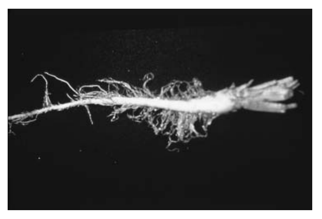
Figure 3. Beets with small and excessively hairy roots.

mately one pint to one quart of soil submitted for testing. The sample should be placed in a durable, moisture resistant sample bag. Keep the sample cool, ideally 50°F, do not leave in direct sunlight or car trunk, and send or deliver to the laboratory as soon as possible. Samples must be labeled with information (location, soil type, cropping history, current and anticipated crop, last nematicide used, etc.) which may aid in identification and diagnosis.