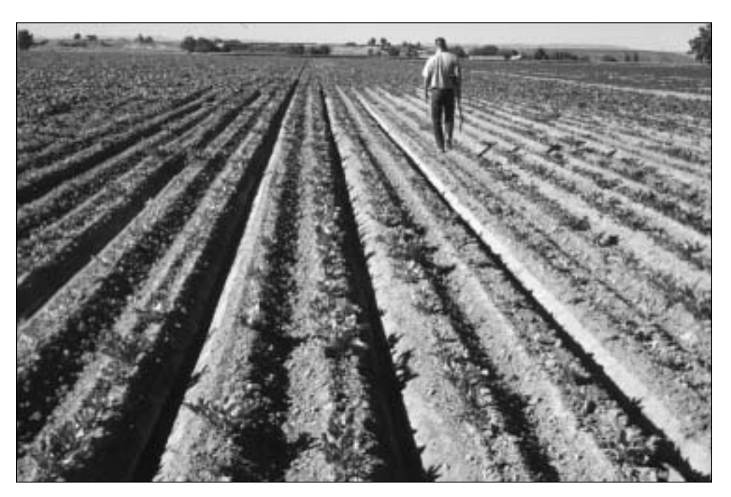
Figure 2. Field plants, patches of SCN infestation.

The maximum time SCN can survive in the soil without a host plant is unknown. A small percentage of the eggs in the cyst can survive in fallowed conditions for more than 12 years after the removal of sugarbeets. Depending on climatic and edaphic factors affecting hatching and survival, the annual rate of decline in fields from which sugarbeets have been removed may vary from 40-50 percent (Table 2). Important factors affecting SCN persistence and survival are: soil type, moisture and temperature; history of pesticide