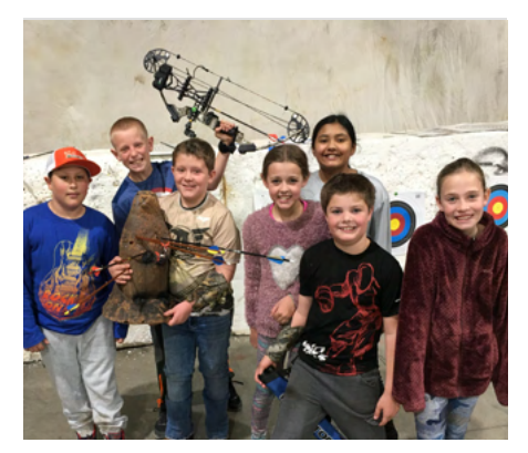
Fun at Archery

Thank you to all the volunteers and members who participated in our fun Spring Break activities.