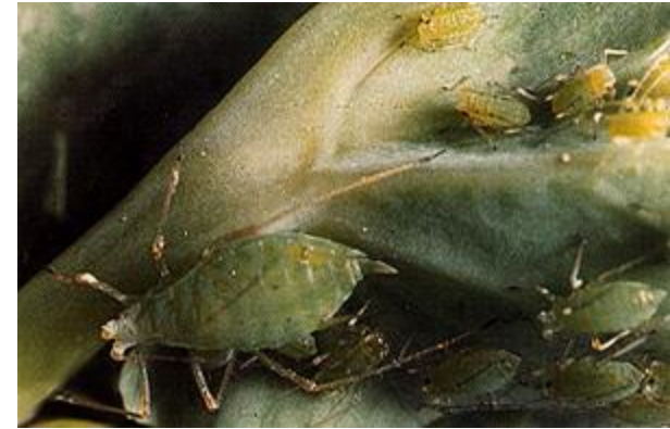
Host plants: alfalfa, red clover, peas, lentils, vetch.