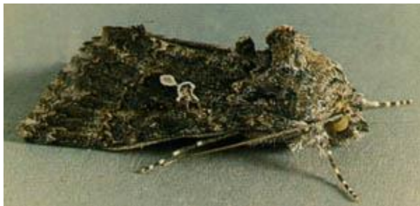
Adults are gray “miller” moths

Host plants: cabbage, spinach, sugarbeets, peas, celery, potatoes, alfalfa, beans, ornamentals, mint.