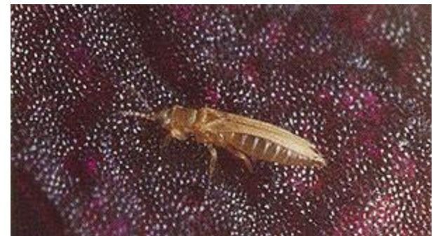
Host plants: beans, peas, corn, cereals, potatoes, alfalfa.