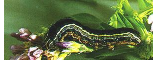
Host plants: peas, beans, lentils, alfalfa, sugarbeets, potatoes.