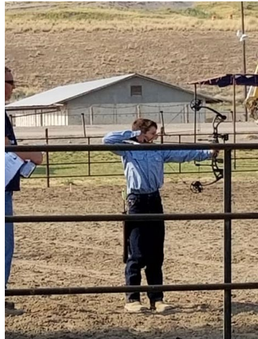
Exhibitor at the 2021 archery show.