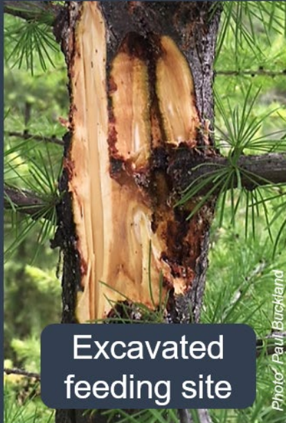
Excavated feeding site