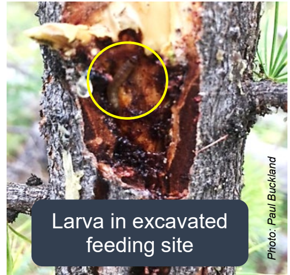
Larva in excavated feeding site

Similar moths usually have a one or a two year life cycle per generation. Adult specimens of Cydia laricana have been collected in Montana in May, suggesting that emergence from infested trees and subsequent attacks on new trees may occur in spring.