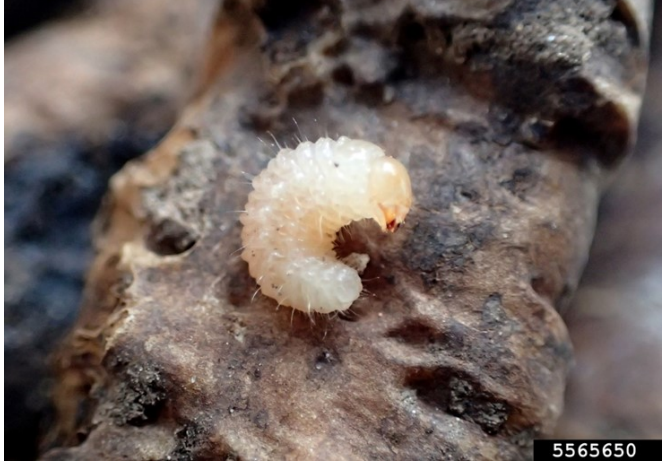
Lilac root weevil larva.

spraying the flowers and upper leaves of the plant when it is in bloom as that may adversely affect pollinators.