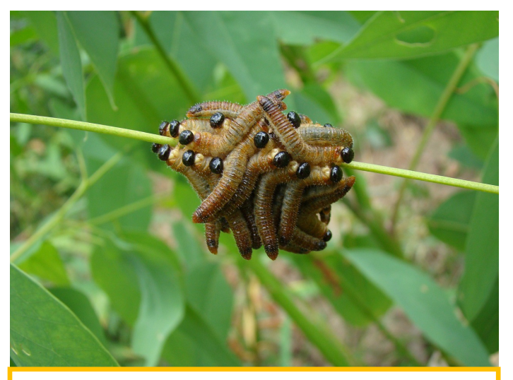
Ground beetles may climb plants to eat soft bodied insects such as these

They most commonly feed at night on grounddwelling pest eggs and larvae. Some adults will climb during the night to feed on caterpillars and soft-bodied insects. Larvae and adults will consume their body weight in prey