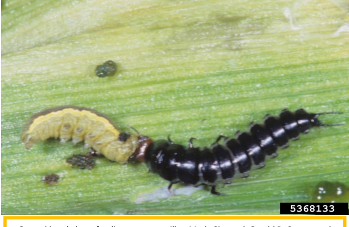
Ground beetle larva feeding on a caterpillar.

Ground beetles are a complex of carabid ground-dwelling beetles that do a lot of good in our yards and gardens. Over 2400 species are known in North America and their color ranges from black to brown. Size ranges from 1/10 inch to 1 \frac{3}{4} in long. Both the adult and larvae are generalist predators.