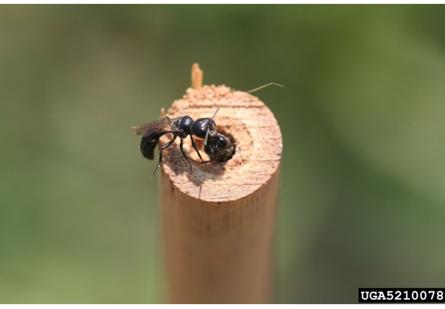
Adult aphid wasps.

These small, black wasps are sometimes observed building a nest in the pith of pruned canes, such as raspberry, blackberry or rose canes. A series of chambers are created in the nest tube. The female hunts and paralyzed (12-24 aphids) to provision the chamber, then lays an egg and seals it off with chewed pith