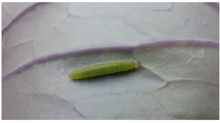
Imported cabbageworm larvae. Lethargic movements when disturbed.

The larvae are about 1 \frac{1}{4} inch long at full size. Their response when disturbed is sluggish. After two to three weeks they pupate on the host plant and emerge in one to two weeks as adults to