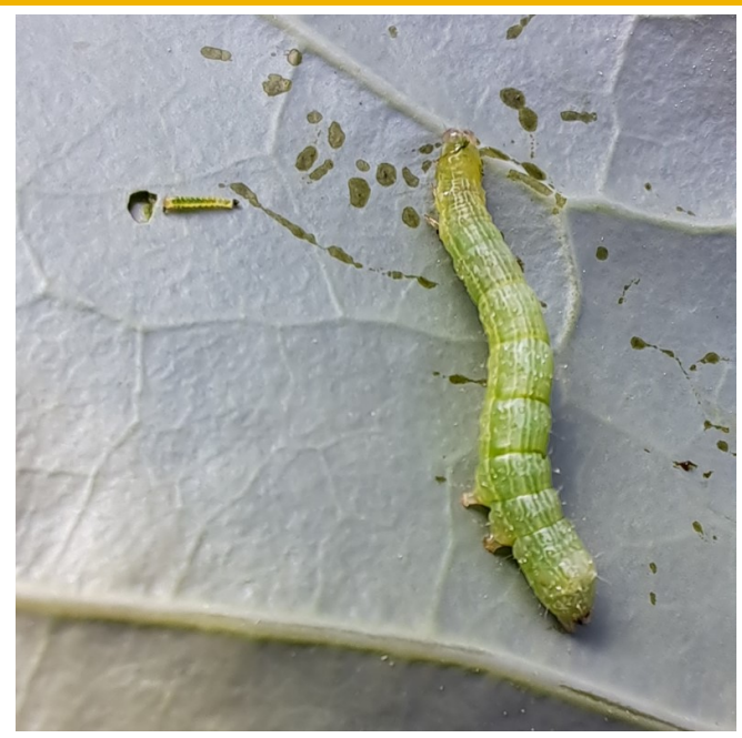
Cabbage looper larva. The small one could be either an imported cabbageworm or diamondback moth larva

Females lay round eggs about the size of a pinhead on the lower, outer leaves. Larvae feed on the upper surface between the large veins and midribs for four to five weeks producing large, irregular holes. They can bore into young cabbage heads, creating unmarketable produce. With two generations a year, the second generation is the