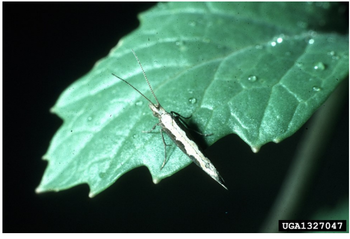
Diamondback moth adult.

Diamondback moth adults are small and skinny. The wing tips scoop up at the end. Adult moths are active at night. The eggs are small and roundish.