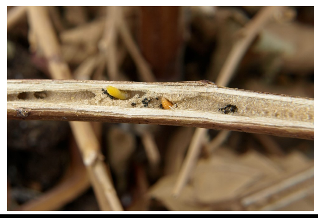
Prepupal stage in next chambers.

http://www.wci.colostate.edu/Assets/pdf/CIIFactSheets/PemphredonWasp.pdf