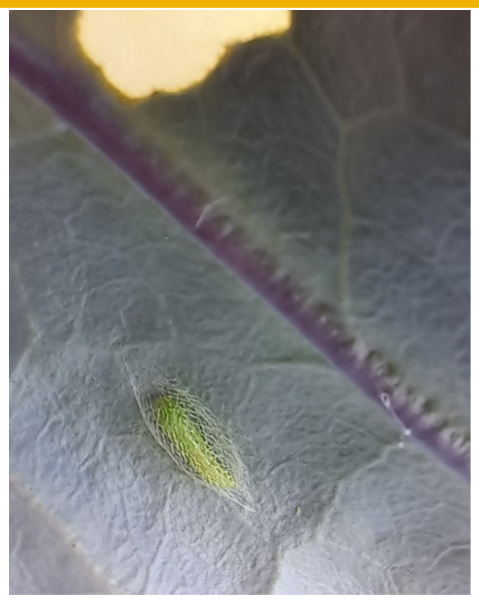
Diamondback moth cocoon. Windowpane from feeding at the top of the photo.

The leaf feeding is usually not economically significant, but the larvae may damage young buds or growing points that stunt the plant. The larvae may also burrow into broccoli or cauliflower flower buds. When disturbed they wriggle rapidly, or drop off, attached to a silken thread.