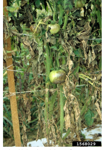
late blight, Phytophthora infestans Sphoto by Edward Sikora bugwood.org

With the high temperatures late blight and early blight are less likely to develop, however, if we have rain and temperatures cool down late blight can go from spore to producing spore in three or four days. Spores have been detected, so keep an eye on your potatoes and tomatoes and let us know if you suspect you have one or the other.