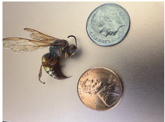
An image of a cicada killer wasp, submitted by a user for ID.

In response to the imperative need for improved pest management tools, we developed an enhanced version of the Idaho Insect ID website by working with the