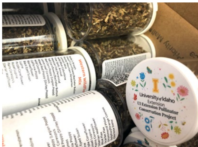
Wildflower seeds kits were mailed out to all 44 counties in Idaho in March of 2022.

We would like to thank University of Idaho Extension for funding this pollinator conservation project, Eden Brothers for providing wildflower seeds and the Xerces Society for Invertebrate Conservation for guidance in selecting Idaho appropriate wildflower seed mixes.