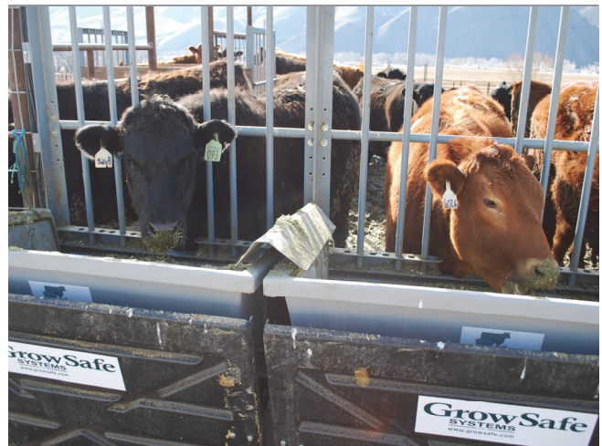
Warm season annuals can produce high tonnage for fall grazing.

In addition, research efforts focused on understanding the genetic and mechanistic components of feed efficiency with hopes of finding improved markers to select animal for feed efficiency.