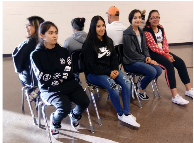
Juntos Family Engagement Workshop — youth and parents working together on family communication.

As a strategy to improve the academic success of Latinx students in Idaho and increase parent involvement, Juntos, a nationally supported 4-H program developed by North Carolina State Extension, has been implemented in Jerome County. Juntos (pronounced "Who-n-toes") means "Together" in Spanish. This program works to unite community partners to support Latinx eighth to 12th grade students and their parents with knowledge, skills and resources to support the youth in their journey to achieve a high school diploma and to encourage families to work together to achieve their youth's academic goals. Family Engage-