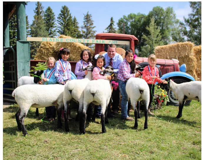
Showing off livestock projects at the fair.