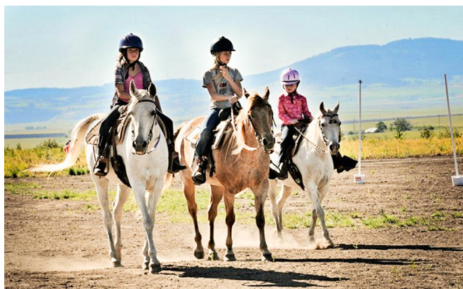
4-H horse project members, Idaho County.