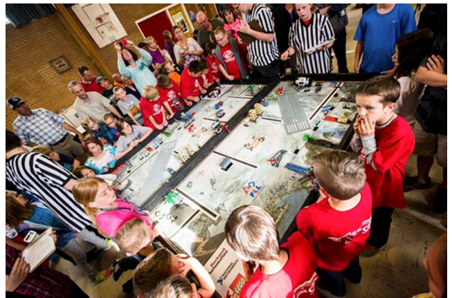
4-H Robotics: Learning STEM (science, technology, engineering, math).