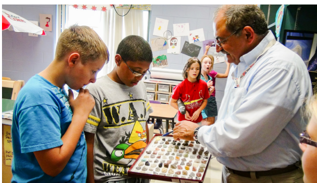
Rock hounds, Elmore County.

Occasionally, members and parents become so focused on the project and subject matter that they forget the importance that club meetings play in the overall personal development of the member. Leaders play an integral role in helping families focus on the importance of well-rounded youth involvement within 4-H.