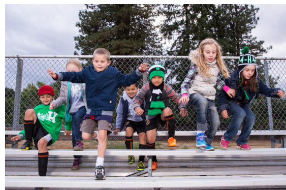
The youngest 4-H'ers: Coverbuds, ages 5 to 7.

In addition to community 4-H clubs, youth may opt to participate in 4-H special interest groups/project clubs that focus on one specific topic, school enrichment activities, or after-school programs.