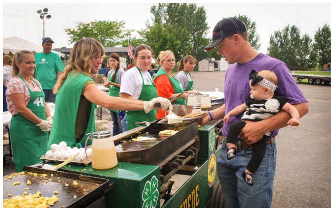
Canyon County 4-H volunteers serving pancakes at the Buckaroo Breakfast 4-H fundraiser.