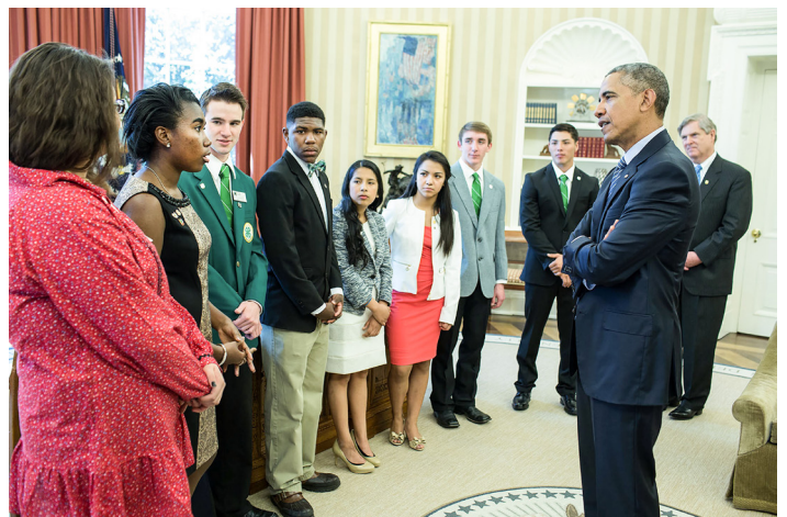
Idaho 4-H youth delegates in the Oval Office with President Barack Obama and U.S. Secretary of Agriculture Tom Vilsack during National 4-H Conference.

Project leadership is provided by authorized adult and teen volunteers.