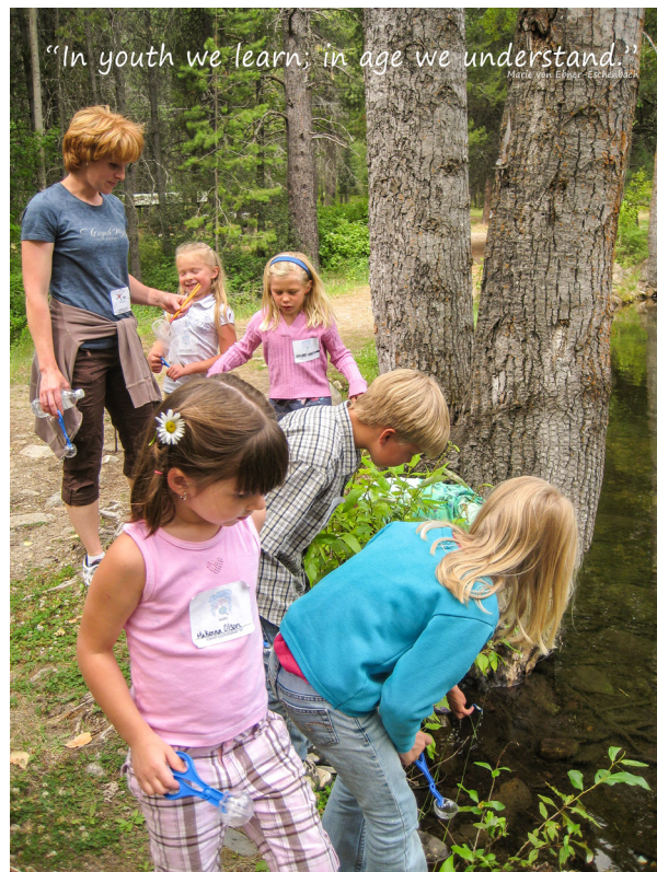
Quote from Marie von Ebner-Eschenback obtained from BrainyQuote.com.

University of Idaho Extension provides instruction and practical, research-based information in agriculture, home horticulture, natural resources, health and nutrition, food safety, financial management, youth development, and community development to all citizens. In addition, the university's resources can be requested to provide assistance in finding solutions to major issues within a community.