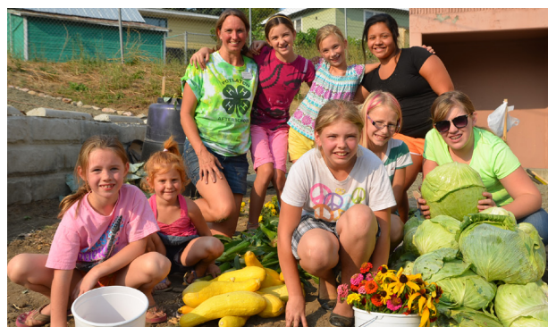
Growing gardeners—Potlatch Kids' Co-op 4-H Afterschool Program.