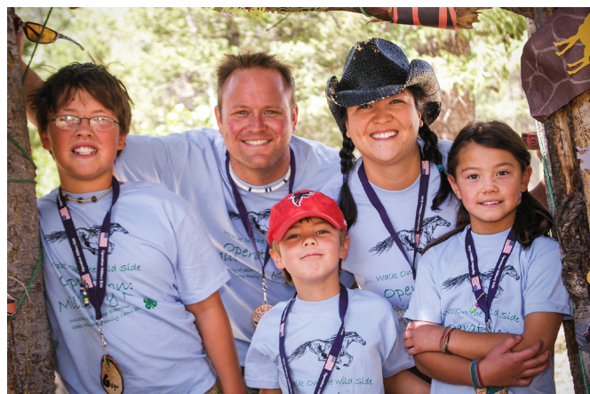
Idaho military family together at camp.