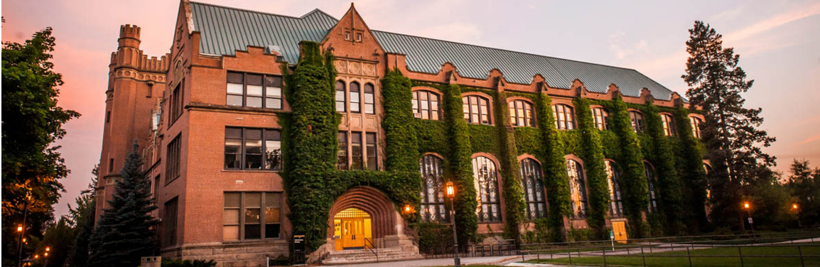
The University of Idaho campus in Moscow, home to the state 4-H office.