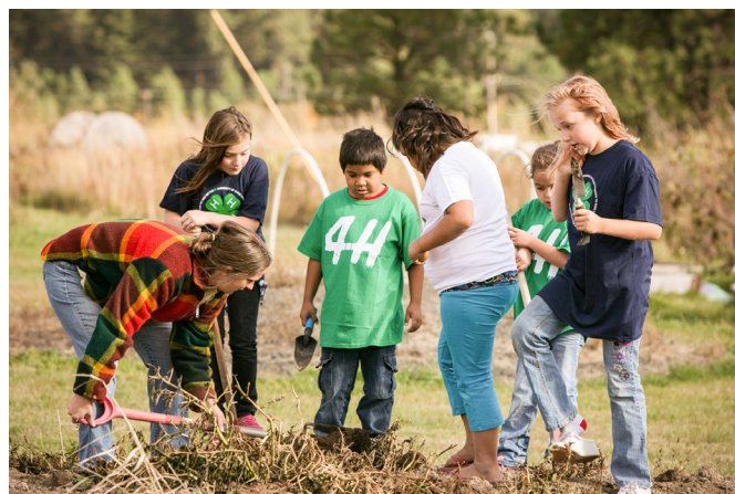
4-H Afterschool garden, Worley.