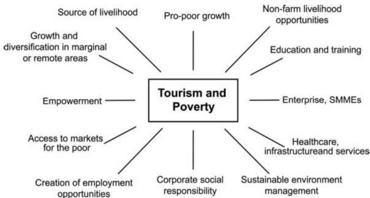
Figure 5 : Achieving equity in poor communities through the incorporation of pro-poor tourism

The purpose of the PPT certification program is to provide a net benefit to both the individual and the community as a whole in low socioeconomic regions. The 38 strategies are meant to go above and beyond the simplistic goal of capital gains for the individual through increased employment of local residents and to instead empower resilience in individuals and support community development. Strategies such as employers providing professional training and English classes allow for career advancements. Use of locally produced goods in business operations, in decorating, and in product sales creates a niche for entrepreneurs seeking financial independence. Programs to train local students, promoting local businesses, and donating to infrastructure improvements are all strategies for community progress. The strategies are also all consistent with any type of tourism business regardless of size, which alleviates previous issues of PPT programs promoting mass tourism.