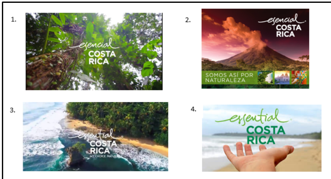
Figure 3: Tourism advertisements utilizing the Costa Rica brand

Sources: (1) Calvo, 2018 – (2) “Procomer awards the country brand”, n.d. - (3) Abissi, 2018 - (4) “The use of the country brand”, 2014