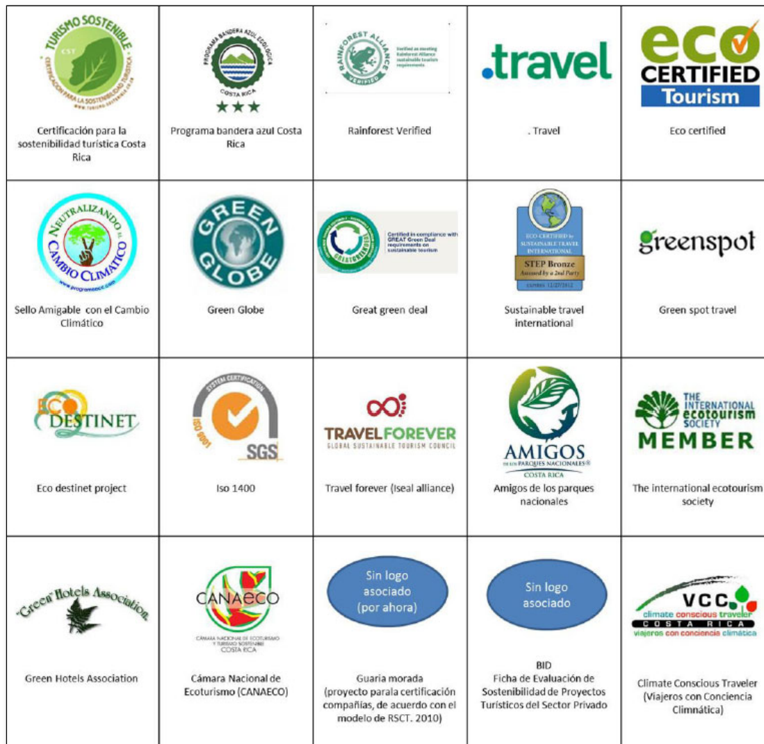
Figure 2 – Existing eco certification labels in Costa Rica

based or social sustainability certifications or seals in Costa Rica. All 20 programs in Figure 2 focus on either environmental sustainability, climate change reduction, or overall sustainability that can include social sustainability aspects within the program.