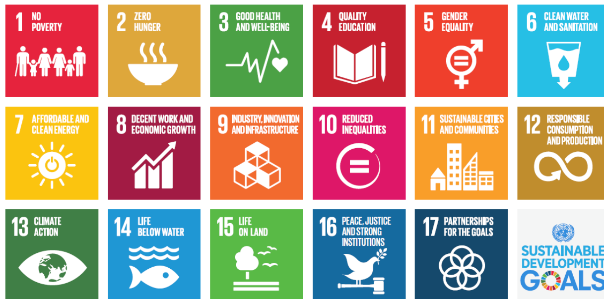
Figure 6: Sustainable Development Goals from the 2030 Agenda for Sustainable Development

The vision of instituting a pro-poor tourism certification program is to effectively address all 3 sectors of sustainability (social, economic, and environmental) at once by tying it to the Certification for Sustainable Tourism certification process. The researcher anticipates the following goals and outcomes if the proposed PPT certification program is implemented with CST. These goals are in line with the SDGs, as notated on each goal, demonstrating that effective certification systems can lead to sustainable development worldwide.