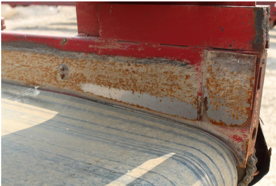
Photo 4. Noticed how shiny and worn down the metal is on the side wall in this photograph? That is from potatoes hitting and rubbing against the metal. Look for areas throughout your operation where you see shiny metal and consider adding padding to minimize the impact on potatoes.