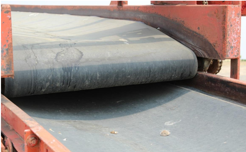
Photo 6. Cleaning equipment before harvesting the new crop is important to minimize disease carryover from one season to the next. Diseases such as bacterial ring rot can survive as dried slime on metal and other surfaces for more than a year. See http://www.cals.uidaho.edu/edComm/pdf/CIS/CIS1180.pdf for more information on cleaning equipment and storages.