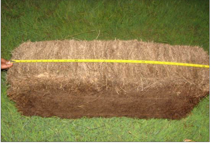
Figure 1. Position the bale so that the baling twine is parallel to the ground. The yellow tape was used to measure the dimensions of the bale.

A straw or hay bale garden is a gardening method used for raising vegetables, herbs, and flowers directly on a bale. Straw or hay bales from alfalfa, wheat, oats, rye, or other cereals are suitable for making a garden bed. Straw bales are preferable over hay because hay bales contain more weed and grass seeds. The bale should be tight and held together with 2-3 strands of plastic baling twine—preferably made from a biodegradable material such as jute and sisal (Figure 1). Biodegradable twines should be positioned parallel to the ground to avoid their hastened decomposition.