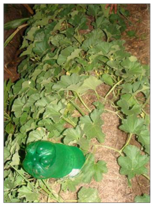
Figure 4. Pierce the lid of a plastic bottle, fill with water, secure lid, set bottle upside down into the bale to provide drip irrigation.

ture. Temperature affects how quickly the plants take up the available water. Liquid organic nutrients can be added to the water.