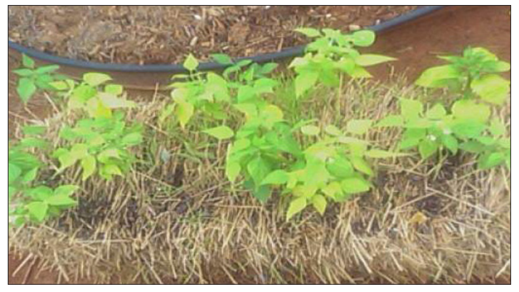
Figure 5. Nitrogen deficiency in pepper.

Adequate nutrient supply is critical for plants growing in bales. Make sure that plants have a sufficient supply of the major nutrients nitrogen, phosphorus, and potassium throughout the season. Nitrogen deficiency is very common in straw bale beds because the microbes are using much of the available nitrogen to break down the bale, and nutrients are lost from leaching. If the oldest leaves begin to turn yellow before their physiological maturity, this is an indication that nitrogen may be limiting (Figure 5). Purpling is a symptom of phosphorus deficiency, while leaf margin necrosis (brown leaf edges) is a symptom of potassium deficiency.