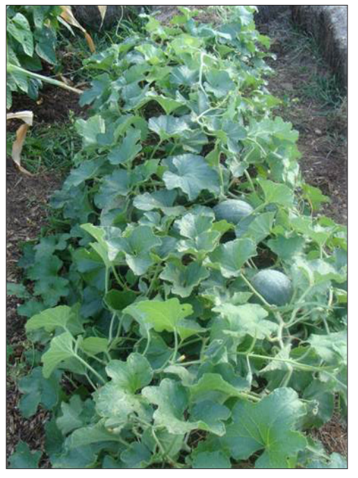
Figure 2. Cantaloupe grown on straw bales.