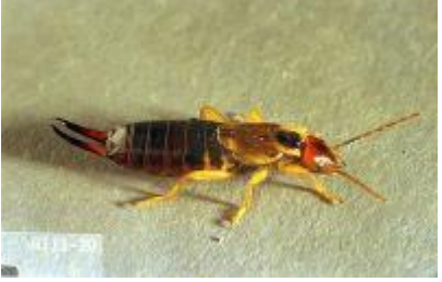
European earwig Forficula auricularia Linnaeus Female adult