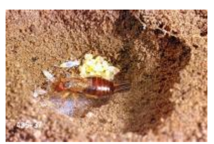
European earwig Forficula auricularia Linnaeus Egg(s) immature female adult