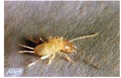
European earwig Forficula auricularia Linnaeus Immature