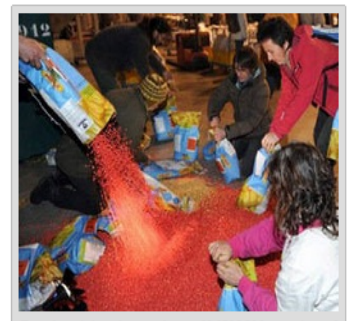
French activists rip open bags of MON 810, a variety of Monsanto's genetically modified corn after entering a Monsanto storehouse.