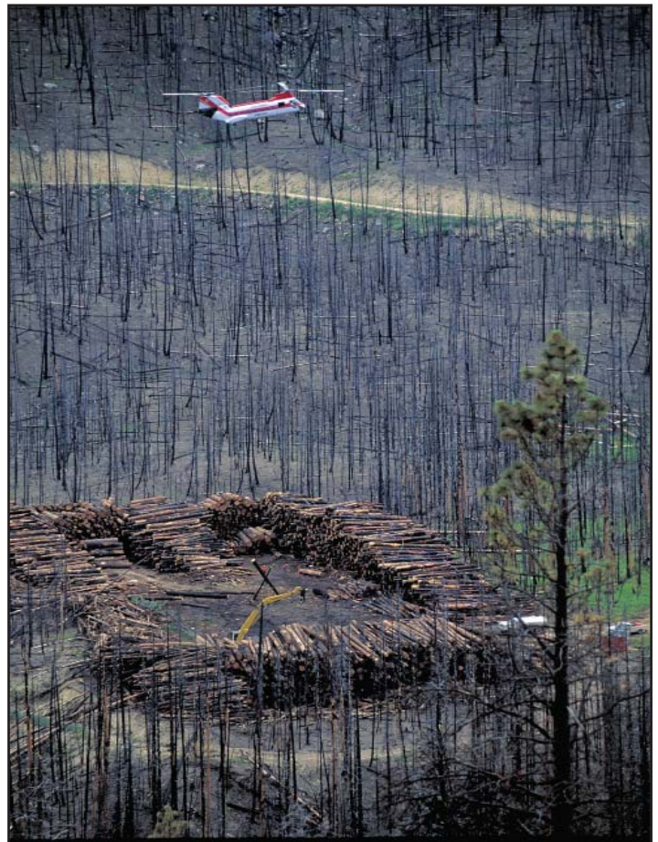
Salvage cuts should be done ASAP after a burn - by year three much or all of the value has been lost.

Salvage cuts are often initiated after a disturbance (fire, wind, insect or disease kill) to recover the value of damaged trees and remove hazard trees. Salvage operations are usually not done unless the material taken out will at least pay the expense of