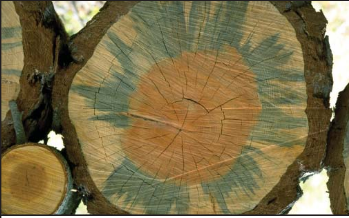
Blue stain fungus is one of the first signs of degradation in log quality.

Fungi require certain levels of temperature, moisture, and oxygen to become established and thrive. When the moisture content of wood falls below 15 percent, fungi become inactive. Some species of fungi do not die at this point, but go dormant and become active again when conditions become favorable. Excessive moisture decreases oxygen supplies, and when wood is completely saturated, oxygen levels are not sufficient to sustain fungal growth. On dry sites, deterioration often occurs on the lower bole where moisture conditions are more favorable. On wet sites, moisture conditions will be more favorable higher up in the stem.