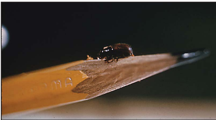
Nothing loves a stressed tree more than a bark beetle - unless it's thousands and thousands of bark beetles.

Second, fires must occur at a time of year when beetles are in the adult stage and can quickly infest susceptible trees. And third, because bark beetles are not very strong flyers, there must be a population of beetles within a reasonable distance to take advantage of weakened trees that become available.