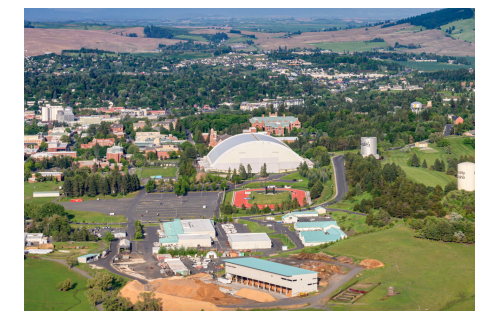
UI Facilities is home to many sustainability partners including Surplus, which diverts materials from the landfill by accepting donations usable items by request.