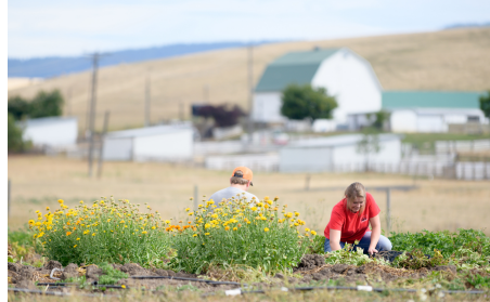
This student-led organic farm creates opportunities for students to work in a living laboratory. The farm hosts seasonal harvest sales and events, but is otherwise not open to the public.