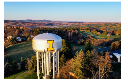
The UI Arboretum is home to many beautiful plant and animal species. Highlights include native Palouse Prairie wildflowers and the water-wise xeriscape garden.