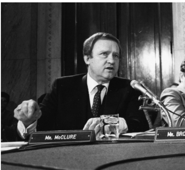
Senator McClure, Hearing on Energy Imports, March 13, 1980

The University of Idaho's James A. and Louise McClure Center for Public Policy Research is dedicated to advancing Jim and Louise's legacy by addressing critical policy issues in Idaho and the surrounding region.