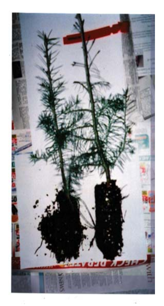
(Pseudotsuga menziesii, needle necrosis)

(root ball with Fusarium osysporum) (below)