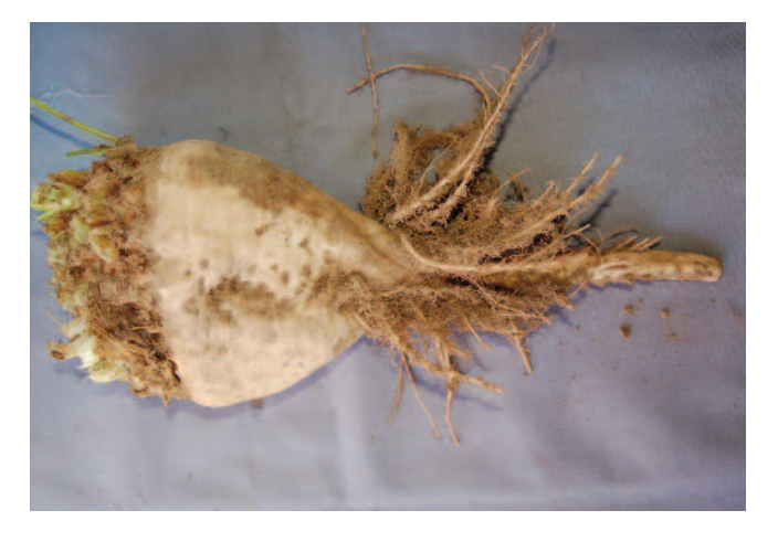
Figure 2. Excessive proliferation of lateral rootlets is associated with rhizomania.