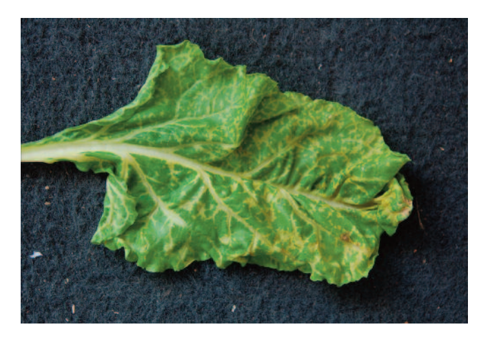
Figure 7. Necrotic yellow veins are the characteristic foliar symptom of beet necrotic yellow vein virus.