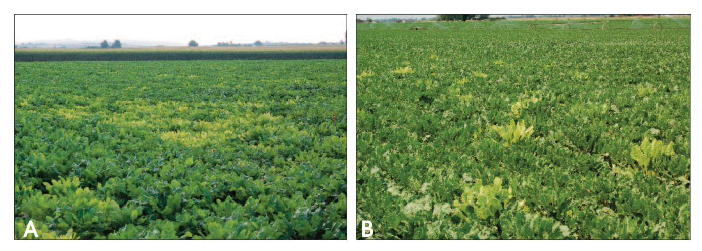
Figure 1. Symptomatic plants can occur in patches (A) or be distributed throughout a field (B).