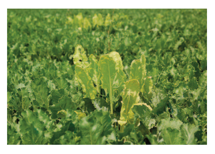
Figure 5. Leaf symptoms consist of slight yellowing to a bright, fluorescent yellow leaf color; narrow erect growth habit; and leaf proliferation.

lateral rootlets (figure 2) that sometimes appear on roots of plants affected by beet necrotic yellow vein virus. In addition to a bearded appearance caused by the prolific lateral rootlets, roots might be stunted and have a wineglass shape (figure 3).