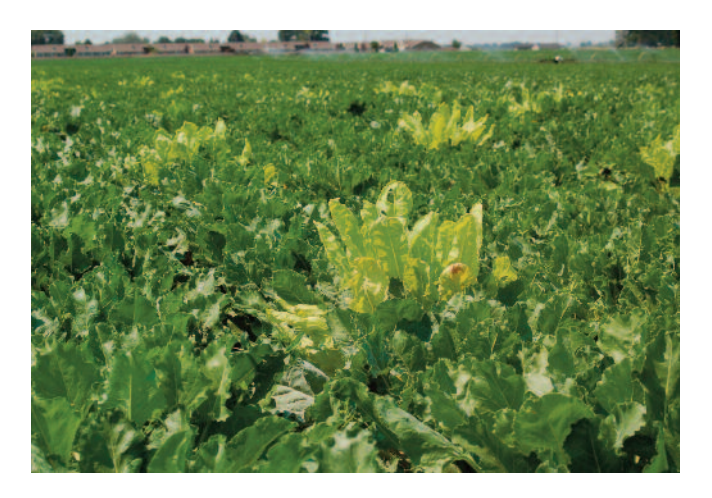
Figure 6. Individual plants (blinkers) showing foliar symptoms of rhizomania.