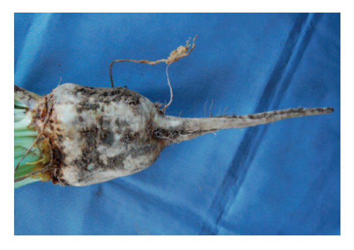
Figure 3. Infection with beet necrotic yellow vein virus can result in a wineglass-shaped root.