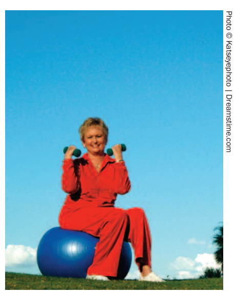
Strength training exercises usually involve weights or stretch bands. Sitting on a ball while exercising improves balance.