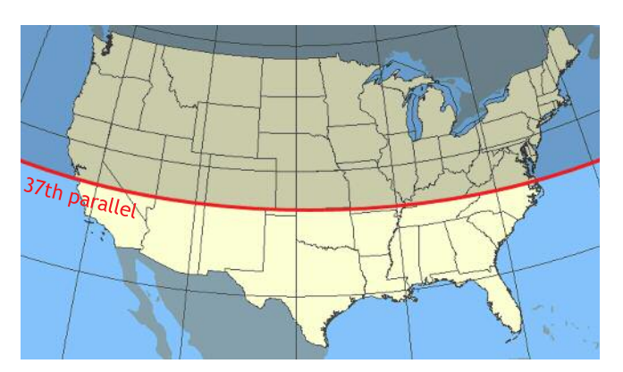
People living north of the 37th parallel can't make their own vitamin D from November to February.

Vitamin D is unique among vitamins in that the skin makes it after exposure to the sun. The amount the skin makes depends on the length of time you have been in the sun without sunscreen, your skin color, your age, and your geographic location. For instance, your body cannot make vitamin D from November to February if you live north of the 37th parallel, approximately the upper half of the United States.