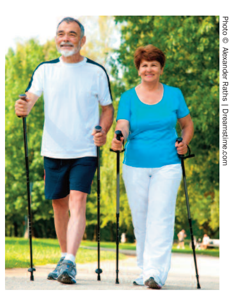
Weight-bearing exercises force you to work against gravity and include walking and jogging.