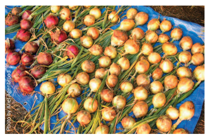
Many home-grown onions often are from sets, or tiny onion bulbs. Idaho quarantine laws require that in Idaho all sets must be certified as disease free. Or, plant from seeds.

The fungus forms sclerotia, or hard black "resting" structures that can live in the soil for up to 30 years. Only Allium species (such as onion, leek, garlic, and shallot) are susceptible. The disease is spread by water, wind, farm machinery, and plant material. Once the disease is in a field, growing Allium species in that location is extremely difficult. The only truly successful method of control is to prevent the fungus from ever entering a growing area.