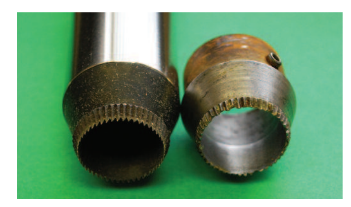
Figure 2. Compare the sharp (left) and dull (right) 3/4-inch diameter serrated tip on a 1-inch tube of a Penn State drill-type single-sample probe. If your probe tip is dull, sharpen it or get a new tip. For these serrated tips, it's easiest to buy a replacement tip when yours is dull.

Not satisfactory. Open augers or corkscrew devices will selectively sample leaf or stem parts and are not satisfactory tools. Never use the "grab-a-handful" or "one-flake" sample methods.