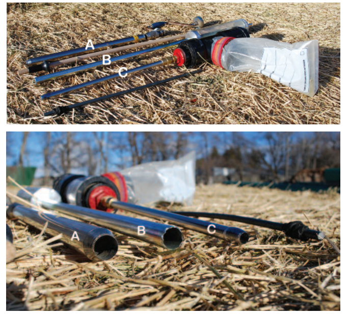
Figure 3. Compare (A) the 3/4-inch diameter serrated tip on a 1-inch tube of a Penn State drill-type single sample probe, with (B) the 3/4-inch diameter scalloped tip on a tube of an AMS drill-type multi-sample probe, and (C) the 1/2-inch diameter scalloped tip on a Star Quality multi-sample push probe. Probes B and C come with a sample container. The remaining item is a wooden or plastic plunger (dowel) that comes with probes to help remove core samples from the probe.

A good average size sample should weigh from 1/3 to 1/2 lb. (150 to 200 grams) as shown in Figure 4. The number of cores versus the weight of samples will depend on the