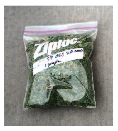
Figure 4. This I/2-gallon sealable freezer bag holds samples of 20 hay bale cores weighing a total 135 grams or 0.3 pound. They came from a 1/2-inch diameter probe. The bag is labeled to enable lot-identification after lab results are in.

kind and size of hay probe. Very small volume samples may not be representative of the entire hay lot. Large volume samples are difficult for laboratories to grind. Consequently, they may not grind the entire sample, thus defeating the purpose of an accurate sampling technique.