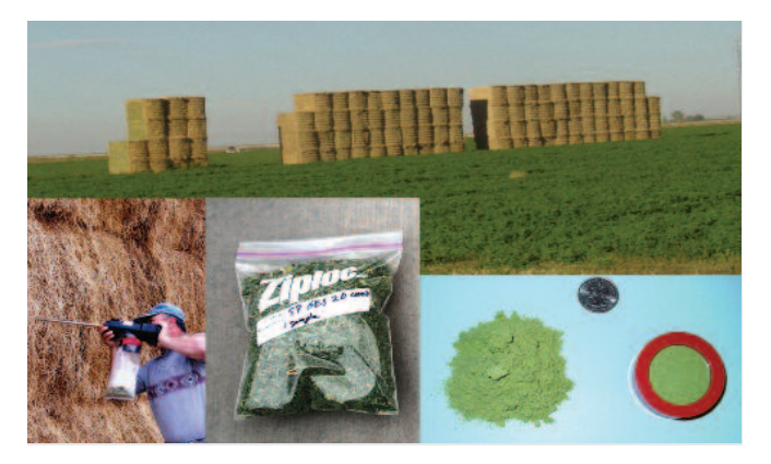
Figure 1. The amount of ground forage sample analyzed by chemistry or near infrared reflectance spectroscopy (lower right) is small in relation to the core sample (lower left and center) of one lot of hay that is sent to a lab. The stack of hay in the background is 3 separate lots from the same field, each from a different cutting.

University of Idaho Extension offices in hay-growing counties often have probes growers can borrow at low or no cost. Also, the National Forage Testing Association offers more details about hay probes and lists certified forage testing laboratories throughout the U.S. at their website—http://forage testing.org. Learn more about Star Quality Probes at http://www.starqualitysamplers.com/forage.php. In 2011, probes cost between $100 and $200. Forage quality sample tests vary in cost from $10 to $50, depending on methods and nutrients analyzed.