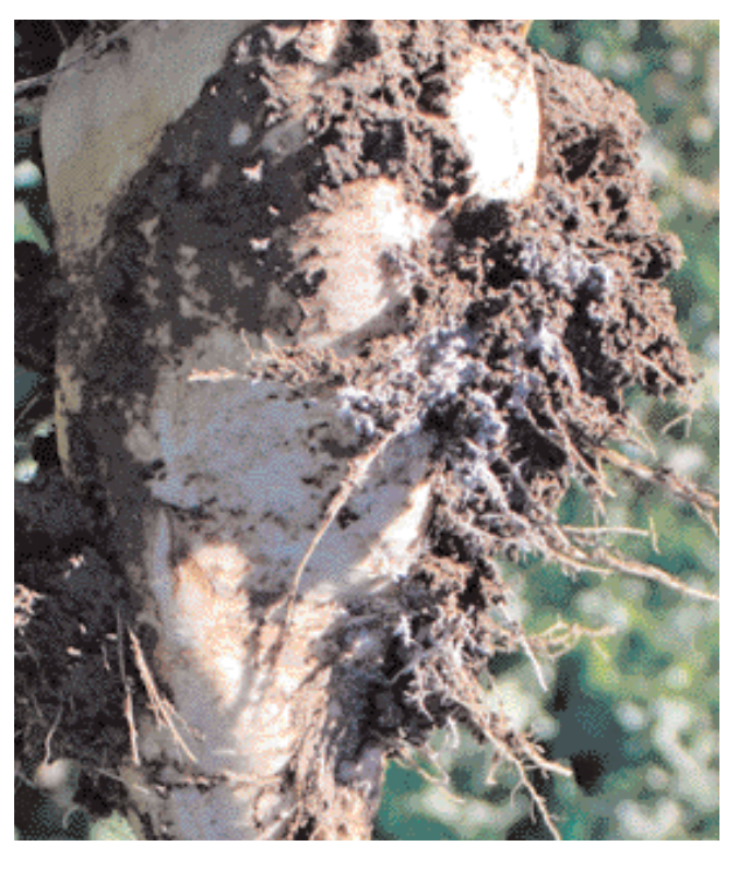
Figure 2. Characteristic "moldy" appearance of a sugar beet root results from white waxy secretions produced by a colony of sugar beet root aphids.

Sugar beet root aphids may be pinhead sized and up to 5/64-inch (2 mm) long. Aphids found on roots are pale whitish yellow and broadly oval to pear shaped (Figure 1). They secrete white, waxy strands, which give beets a distinctive "moldy" appearance (Figure 2) that makes infestations more noticeable. These waxy, "mold-like" secretions are not likely to be confused with symptoms associated with the most common sugar beet diseases.