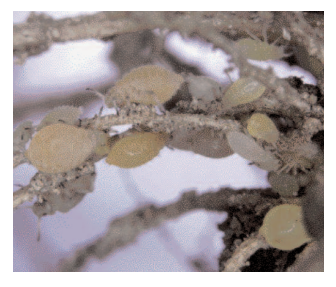
Figure 6. Two unidentified species of root aphids found on the weed common lambsquarters. These aphids can be distinguished tentatively from sugar beet root aphids by a darker green coloration and/or lack of obvious white, waxy secretions. These species are not known to attack sugar beets.