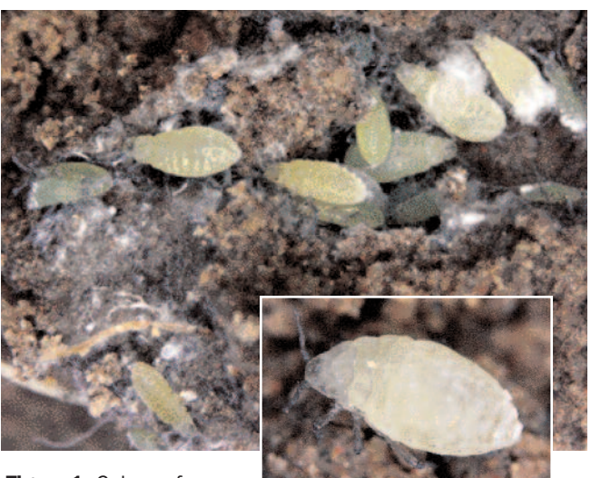
Figure 1. Colony of sugar beet root aphids.

This publication will help you design an integrated pest management (IPM) program for management of the sugar beet root aphid. The IPM approach combines cultural and biological controls with field scouting in order to reduce the need for chemical controls. Beet growers who use IPM can increase profits while encouraging natural enemies of pests and reducing potential harmful environmental effects associated with pesticides.