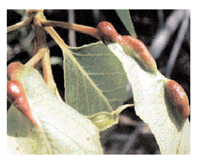
Figure 4. Feeding by a sugar beet root aphid nymph induces the formation of a pouch-shaped gall (or abnormal swelling) along the midrib of the leaf of certain Populus tree hosts. Galls may project from the upper or lower surface of the leaf, and multiple galls may be found on a single leaf.

Like all aphids, sugar beet root aphids have piercing/sucking mouthparts that are used to feed on plant fluids. Sugar beet root aphids feed on the roots of their host plants and do not feed on the foliage of sugar beets as do green peach aphids and black bean aphids. Root aphids cause damage to sugar beets by sucking sap from plant roots, which interferes with water and nutrient uptake by the plant.