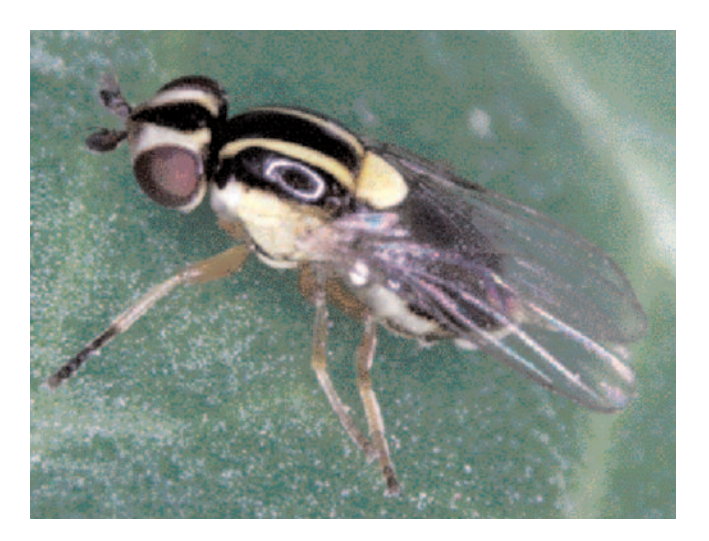
Figure 7. Adult Thaumatomyia glabra are about 5/64–1/8" (2–3 mm) long, and may be found alighting on foliage of sugar beets. The larval stage of this fly feeds on sugar beet root aphids and is capable of reducing aphid infestations below damaging levels.

A fungus (Entomophthora aphidis) also has been reported to drastically reduce root aphid populations in some years. Other arthropod natural enemies, including predatory ground beetles, likely contribute to control of root aphids to some extent. We do not yet know enough about T. glabra or other natural enemies to suggest practical ways of manipulating and enhancing