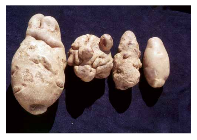
Figure 4. Tuber deformation caused by tobacco rattle virus