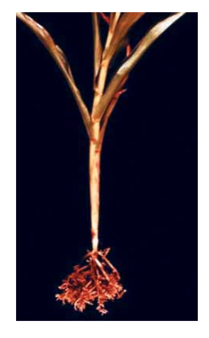
Figure 7. Stubby root symptoms on corn caused by stubby-root nematode