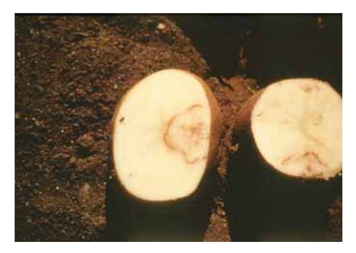
Figure 3. Internal symptoms on potato tuber caused by tobacco rattle virus

The flesh beneath the spots also is brown and corky and the lesions may be shaped like those on the surface. In due course, tubers exhibit deep cracks and shallow corky depressions on their surface, which render them unmarketable. Usually the flesh shows much more corking and discoloration than appears on the skin of affected tubers. Severely affected tubers may be malformed and the skin roughened (figure 4).