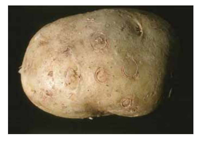
Figure 1. External symptoms on potato tuber caused by tobacco rattle virus