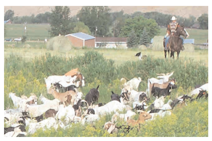
Figure 2. Herder on horseback checks on the impact of the goats on target weeds and desirable plants.

The ideal time to graze is when the weeds are most susceptible and the desirable vegetation is dormant or inactive. When both weeds and desirable vegetation are actively growing and palatable at the same time, growers will need to determine an acceptable level of impact on the desirable vegetation. They may need to use an alternative grazing period.