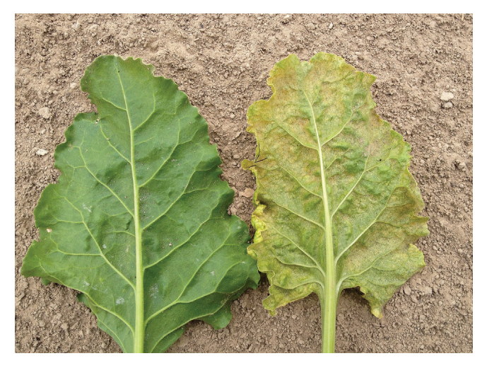
Figure 2. Advanced symptoms (silvering and bronzing) of twospotted spider mite feeding damage. Left leaf healthy; right leaf showing bronzing and silvering.