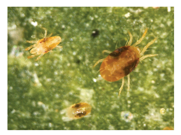
Figure 3. Twospotted spider mites showing characteristic black spots on abdomen of adult male (upper left) and female (upper right) and nymph stages (lower middle).

Eggs are clear to milky-white spheres about 1/150 of an inch (0.18 mm) in diameter (figure 4) and usually laid on the underside of leaves or beneath the protective webbing.