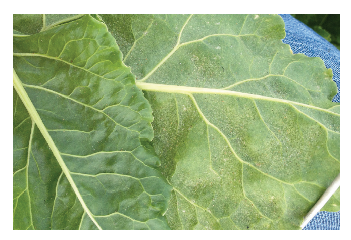
Figure 1. Initial damage caused by twospotted spider mites. Left leaf healthy; right leaf shows signs of stippling caused by pierced plant cells filled with air.

stippling of leaves caused by TSSM piercing individual cells (figure 1) and sucking the cell content, which allows the cells to be filled with air. Continued feeding results in silvering and bronzing of leaves (figure 2), and, eventually, in dying of affected leaves as well as potential defoliation of the whole plant. TSSM-infested plants show reduced plant vigor, tonnage, and sucrose content as a consequence of inhibited photosynthesis and sugar production. In addition to signs of feeding damage, TSSM produce distinctive webbing on the underside of sugar beet leaves that can hinder control efforts by interfering with natural enemies of TSSM and by preventing good contact of pesticides with plant foliage. Foliar symptoms of bronzing, in conjunction with wilting, can be misdiagnosed as drought stress, especially on field edges.