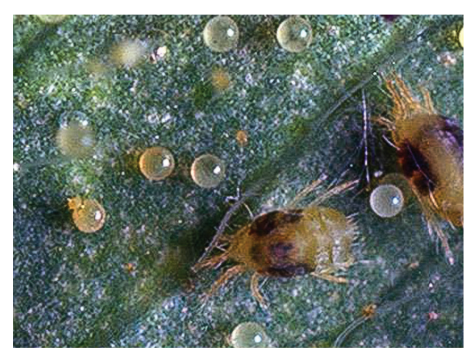
Figure 4. Eggs of twospotted spider mites amid a group of adult mites.