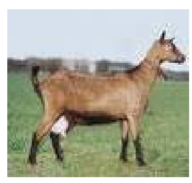
FRENCH ALPINE goats vary greatly in color and can be solid or spotted. Colors include tan, black, white, red, cinnamon and brown.