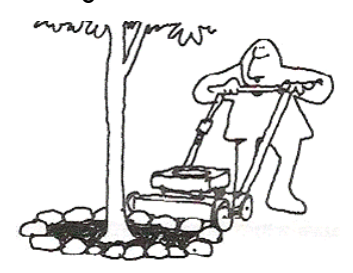
Drawing courtesy Tree City USA Bulletin No. 14