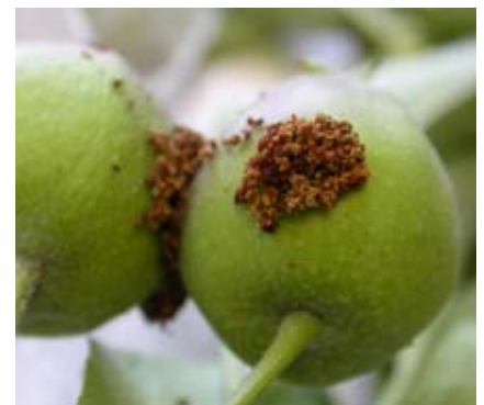
Fig. 4 Frass from codling moth exit 1