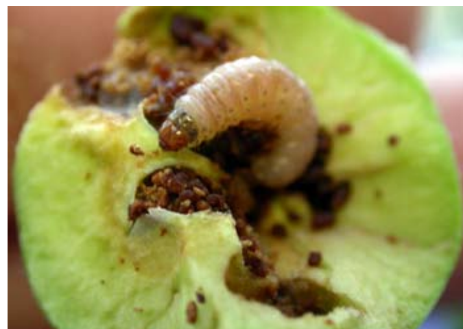
Fig. 2. Codling moth larva 1

Codling moth ( Cydia pomonella – Family Tortricidae) is the most serious pest of apple and pear worldwide. In most commercial fruit producing regions and home yards in Utah, fruit must be protected to harvest a crop. Insecticides are a main control tactic. There are new insecticide compounds available, many of which are less toxic to humans and beneficial insects and mites than earlier insecticides. For commercial orchards with more than 10 acres of contiguous apple and pear plantings, pheromone-based mating disruption can greatly reduce codling moth populations to allow reduced insecticide use. Effective biological control has not been possible because fruit is attacked by newly hatched larvae, which are protected from natural enemies once inside the fruit. Sanitation methods can help reduce codling moth densities within an orchard but alone cannot provide satisfactory control.