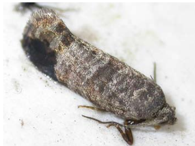
Fig. 1. Codling moth adult 1