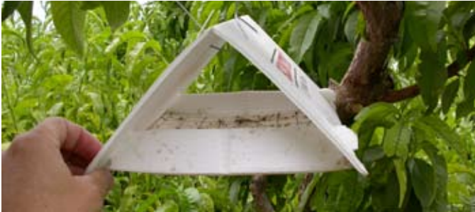
Fig. 5 Delta trap 1