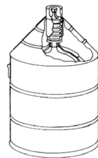
Fig. 2 Typical dewar