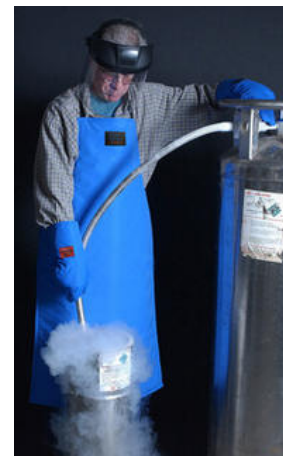
Fig. 5: PPE

A cryogen apron and safety shoes are highly recommended for people involved in the handling of larger cylinders. Depending on the application, special clothing suitable for that application may be advisable.