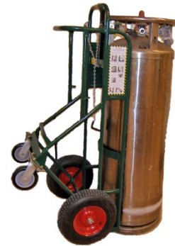
Fig. 4: Cylinder cart