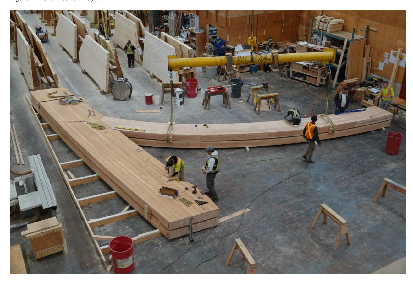
Figure 5 Portal truss fabrication