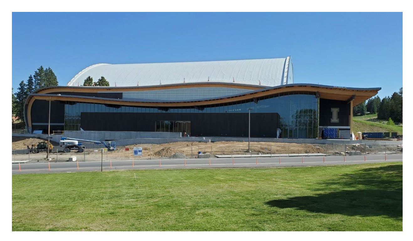
Figure 3 North Elevation May 2021