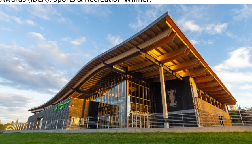
Figure 1 Completed building 2022

2022, International Interior Design Association (IIDA), Gateway Chapter, Interior Design Excellence Awards (IDEA), Sports & Recreation Winner.