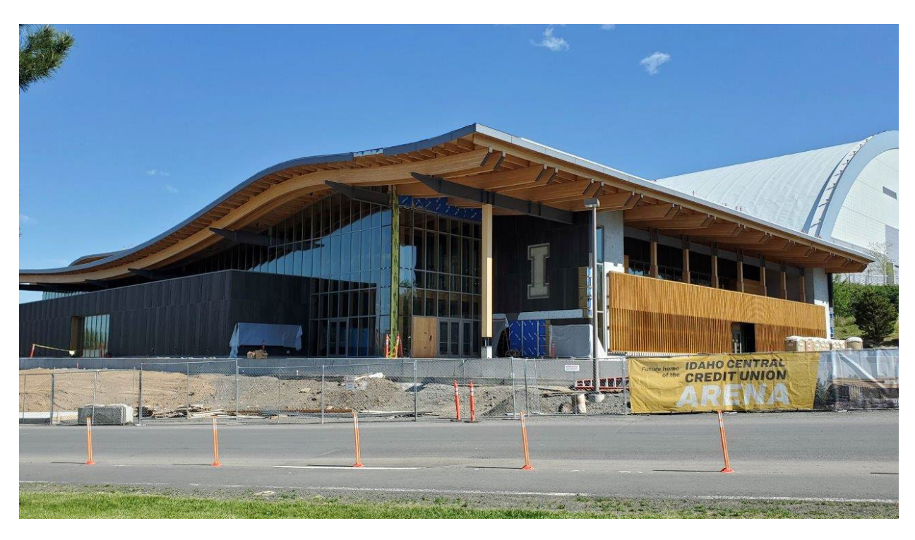
Figure 2 Northwest corner May 2021