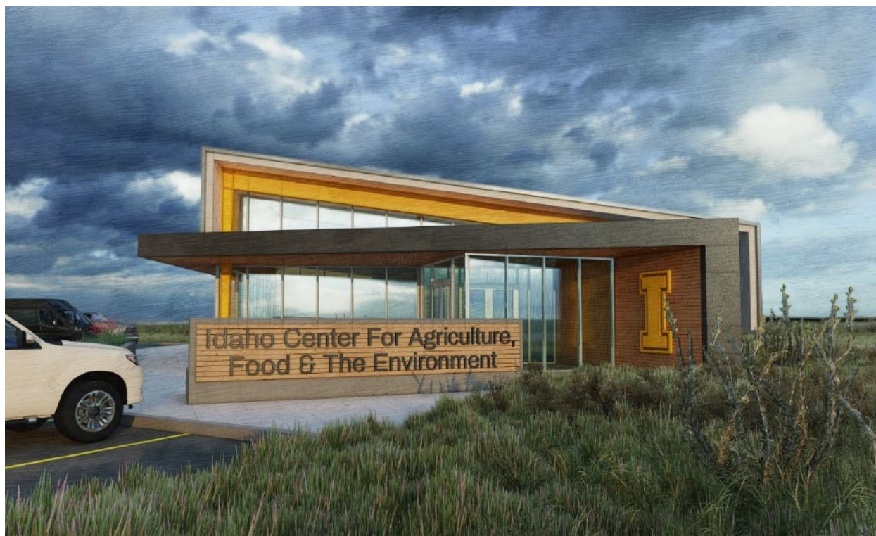
Figure 1 Image from Lombard Conrad Architects

Chobani Commits $1 Million to Nation's Largest Research Dairy