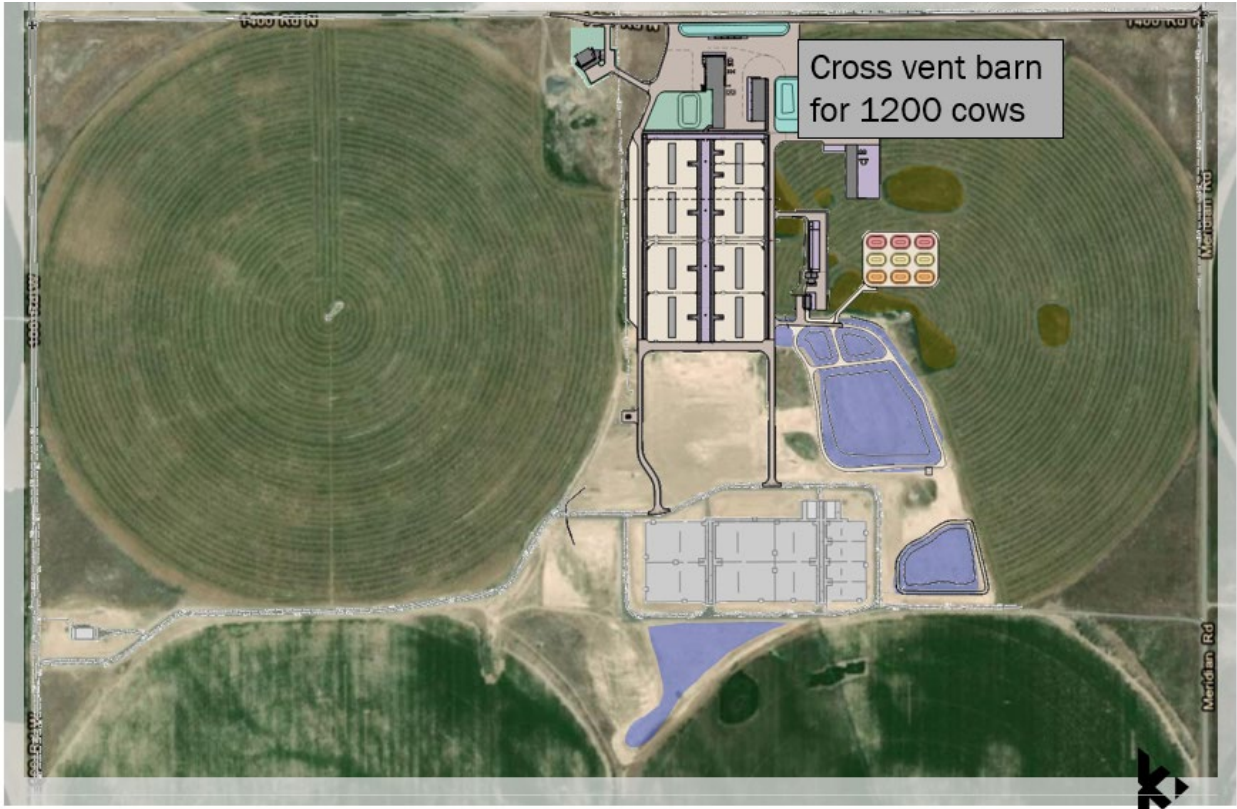
Figure 2 Proposed Experimental Facilities