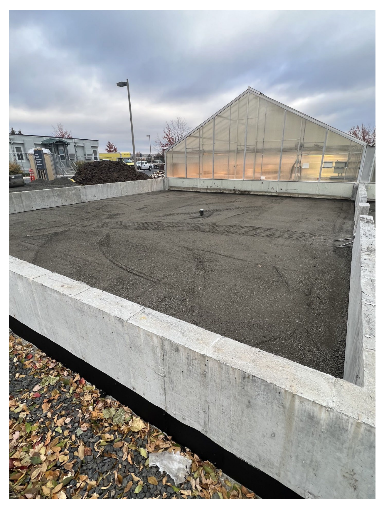
Figure 2 Greenhouse foundation