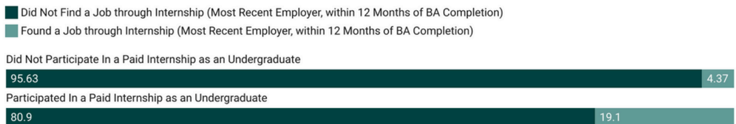
Figure 3. Rural First-Generation Students' Internship Experience and Whether They Found Most Recent Job through Internship