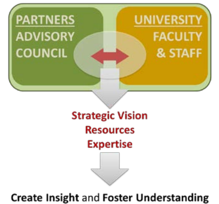
Create Insight and Foster Understanding for the Stewardship of Rangelands