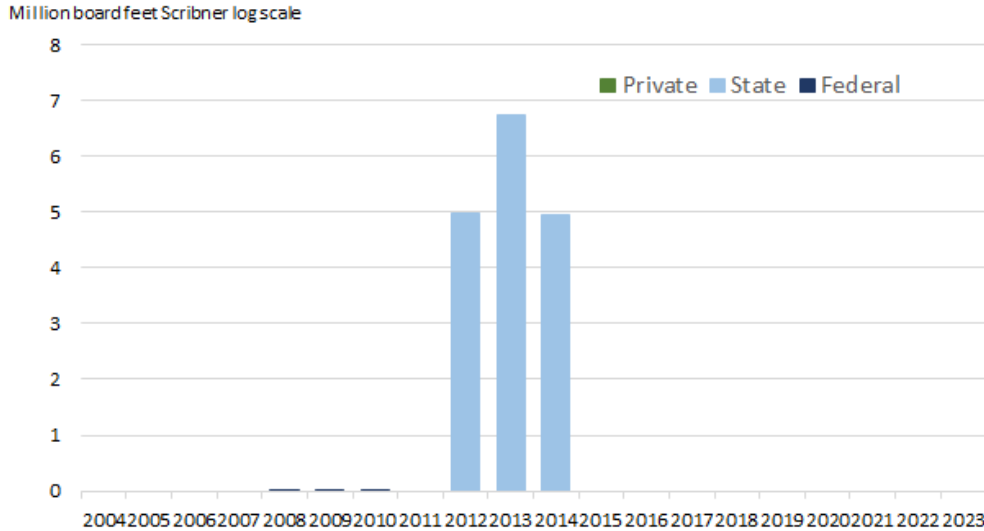
Butte County Timber Harvest by Ownership 2004 - 2023