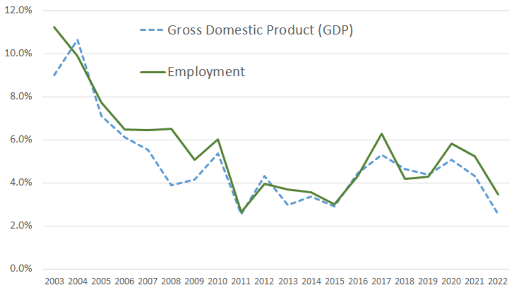
Forest Products Industry Economic Contributions as a proportion of total county economy

3.5% of total county employment -34% from 2021