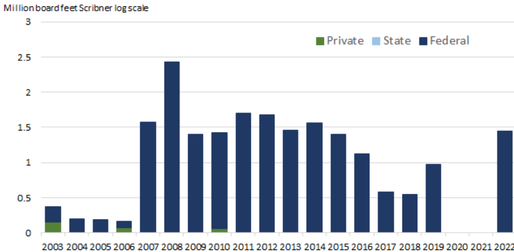
Bonneville County Timber Harvest by Ownership 2003 - 2022