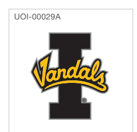
*This mark is to be used for embroidery only.