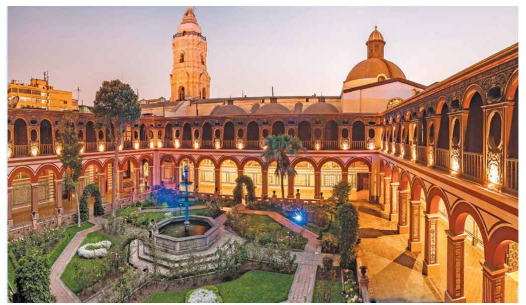
Monastery of Santo Domingo, Lima