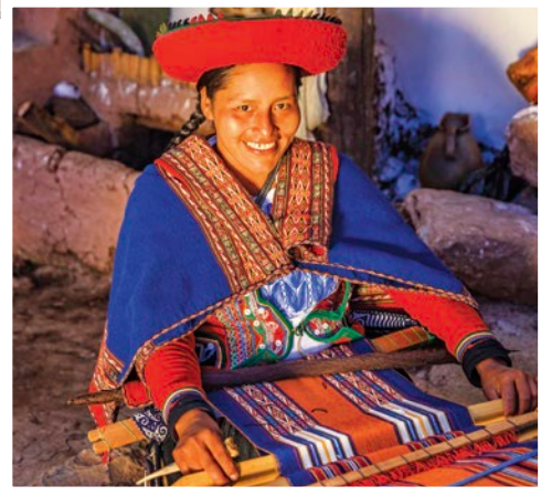
Above: Plaza de Armas, Cusco | Inset: Local woman weaving

Take in scenic views on a train ride through the Sacred Valley to the town of Aguas Calientes and the Inkaterra Machu Picchu Pueblo hotel.