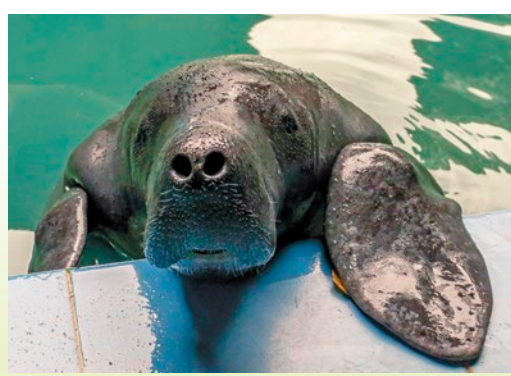
Manatee Rescue Center