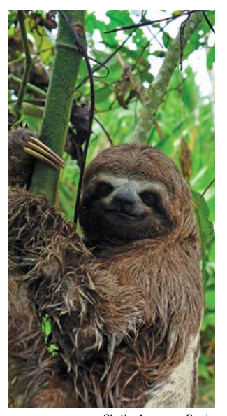
Sloth, Amazon Basir