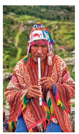
Traditional Peruvian music

Knowledgeable Lecturers deepen your appreciation for the region and its history, culture and current events.