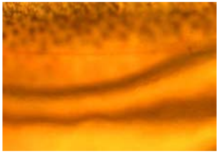
(a) bright-field view;

Embryos 60 days post-transplantation still contain sockeye salmon cells; the orientation of injected cells (or cells derived from the injected cells) supports the conclusion that they have colonized the developing ovary.