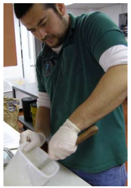
Mixing diets. Picture can be placed anywhere in article

Using a similar approach now with a fixed level of dietary CHO, he is also evaluating the effect of different amino acid levels in trout diets. For this, Leucine, isoleucine and valine, also known as branched chain amino acids