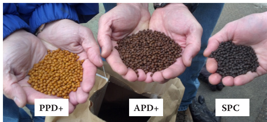
Figure 3. The three diets used for the production trial

Wendy M. Sealy, USFWS, Bozeman Fish Technology Center