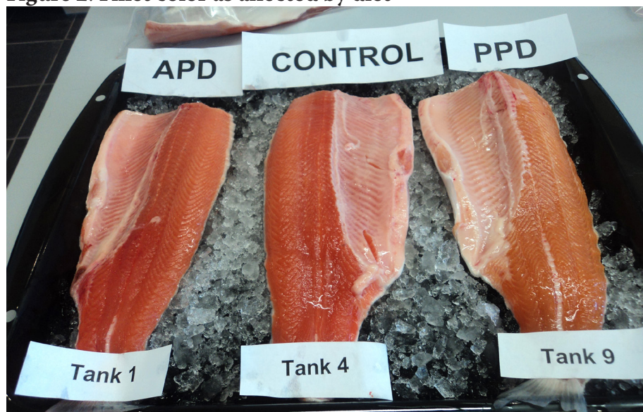
Figure 2. Fillet color as affected by diet